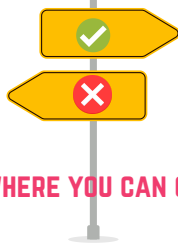
WHERE YOU CAN GO